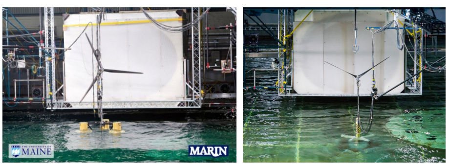
DeepCwind turbine semi

This expertise and experience is combined in performing hydrodynamic studies for floating wind turbines. Thereby, time domain simulations and model tests are carried out to gain insight into the limitations of innovative systems. Previous experience includes studies on, Gicon Floating Wind Turbine, Glosten Floating wind turbine, Hexicon Floating Wind Turbine, SBM IFPEN floating wind turbine and many more.